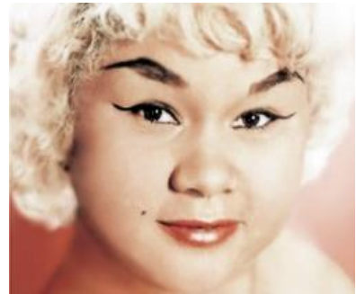
Jamesetta Hawkins January 25, 1938-January 20, 2012

Etta James was an American singer. Her style spanned a variety of music genres including blues, rhythm and blues, rock and roll, soul, gospel and jazz.