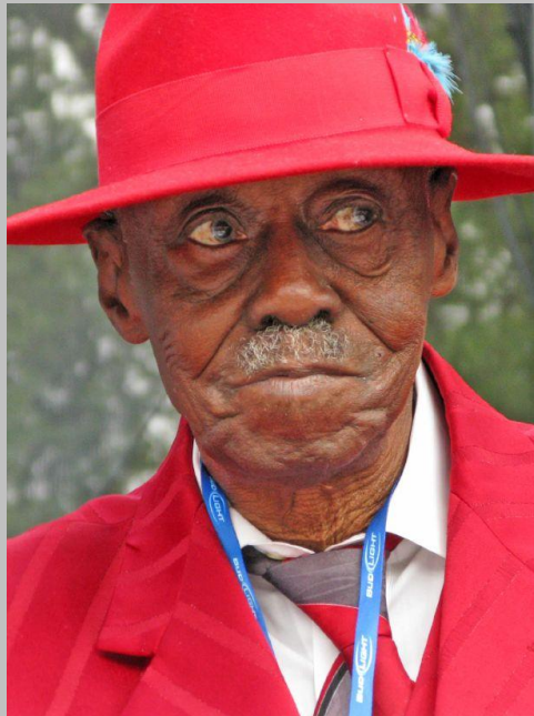
Joseph Williams Perkins (Pinetop Perkins) July 7, 1913- March 21, 2011

LAST ALBUM: LAST OF THE MISSISSIPPI DELTA BLUES MAN: LIVE IN DALLAS